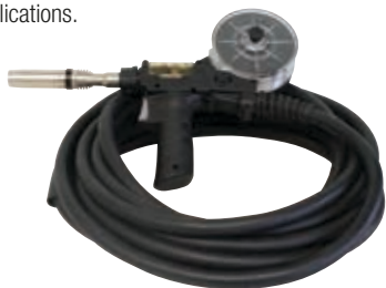
SUREGRIP SP24 200 AMP