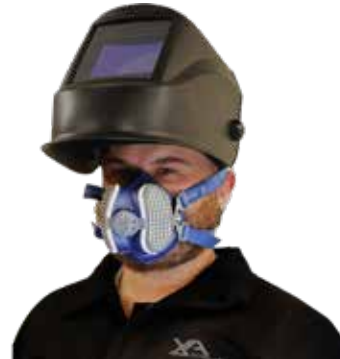
WELDING HELMET NOT INCLUDED