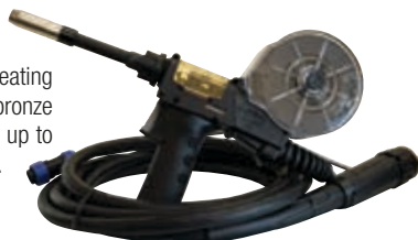
SUREGRIP SP15 150 AMP